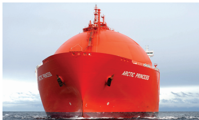
Figure 2. LNG Carrier (Moss Type)

The assessment of costs related to fuel consumption is based on the drag that the hull creates when moving through water and the efficiency of the prime mover. Modern LNG carriers are fitted with bulbous bows designed to break through the ice