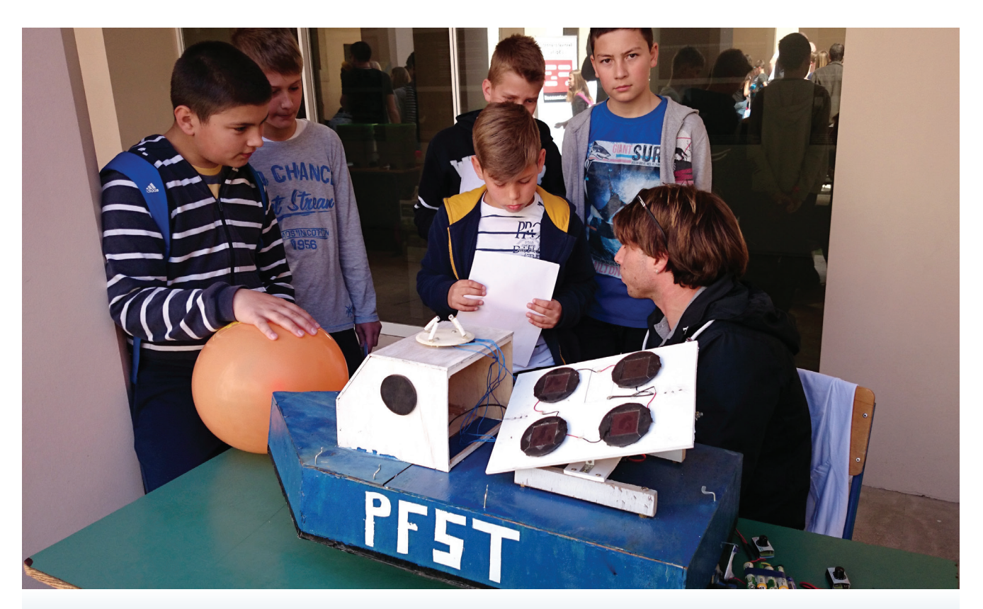
Figure 1. Ship model at the Festival.

by lending them the ability to rotate towards sources of light using simple photo-resistors instead of electronics. Mr. Stanić built the solar panel ship model from scratch. A video of the ship's navigation is available in the supplementary materials (at link: http://toms.com.hr/archive/vol4/no2/maritime_faculty_ presented_student_works.mp4).