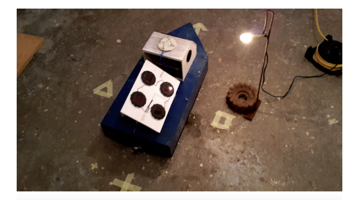
Figure 2. Solar panel rotation towards sources of light (starboard).