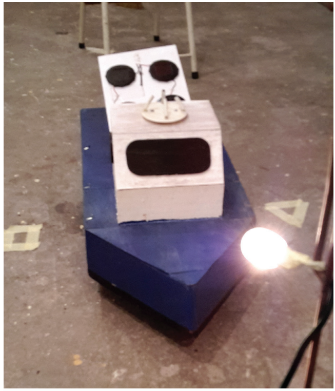
Figure 4. Solar panel rotation towards sources of light (starboard).

The other presentation of the Faculty of Maritime Studies in Split was an experimental simulation of a magnetic storm, performed by student Željka Popović, also a member of the Faculty's Student Council. She used a student globe, compass and an electromagnet. Compass needle started changing direction with the approach of the solar storm (with the electromagnet acting as the storm). The experiment shows how we depend on our star.