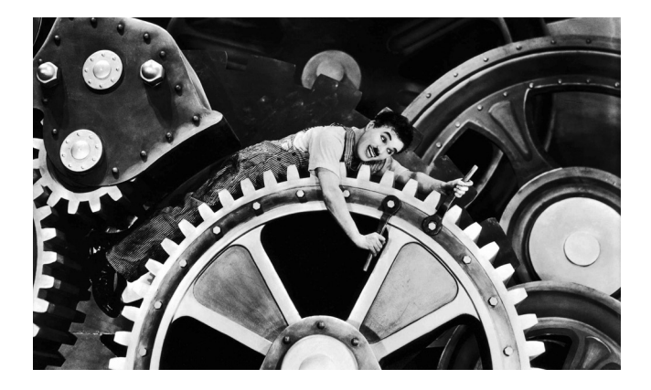
From the movie Modern times.

Fatigue is an important health issue, with significant