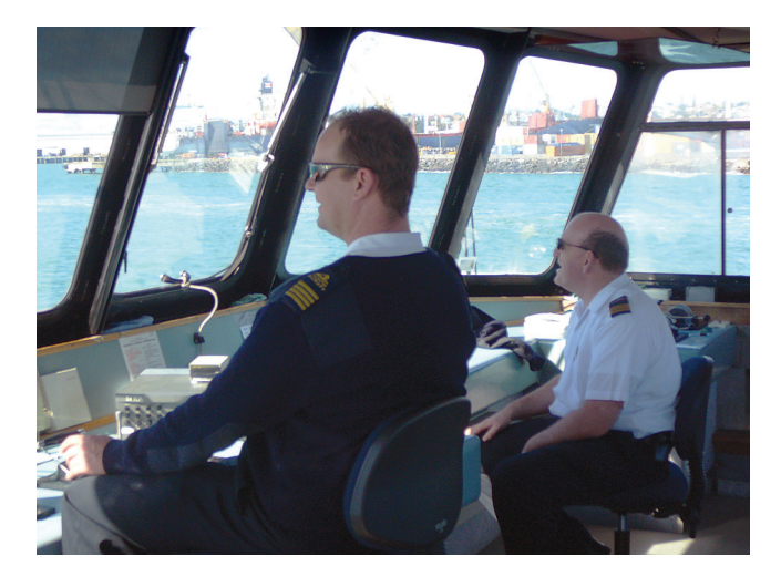
Auckland Seafarers Maritime Union of New Zealand members at Fullers, Ports of Auckland, August 2008.

Under International Labour Organisation regulations (social provisions) it is permissible for seafarers to work up to 91 hours a week - and, under the International Maritime Organisation's Standards of Training, Certification & Watch-keeping (STCW) 2010 amendments (safety provisions), a 98-hour working week is allowed for up to two weeks in 'exceptional' circumstances. The 2010 'Manila Amendments' require a minimum of 77 rest hours in any seven-day period. The hours of rest may be divided into no more than two periods per day, one of which shall be at least six hours in length, and the intervals between consecutive periods of rest shall not exceed 14 hours. Exceptions to the requirements are permitted in the case of an emergency or in other overriding operational conditions. A party to STCW (usually the administration of the flag state) may also allow exceptions from the required hours of rest provided that the rest period is not less than 70 hours in any seven-day period – and these exceptions cannot be permitted to extend for more than two consecutive weeks. The intervals between two periods of such exceptions shall not be less than twice the duration of the exception.