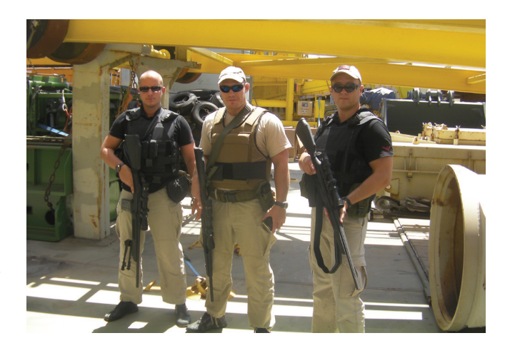
IMO agrees guidance for private security guards.

Involvement of a security company for protection of vessels passing area considered dangerous looks as new business in maritime trade. Armed guards use a weapon which has to be paid by shipper. After passing threatened area and before arriving in the next port of call, the weapon has to be destroyed. This is usually to be done by dropping the same into the sea of Gulf of Aden which is already considered as polluted with weapons before piracy appearing. The price of arms is estimated at 20,000-40,000 USD. It is supplied anew for each trip. It seems that once again benefit everyone except seamen.