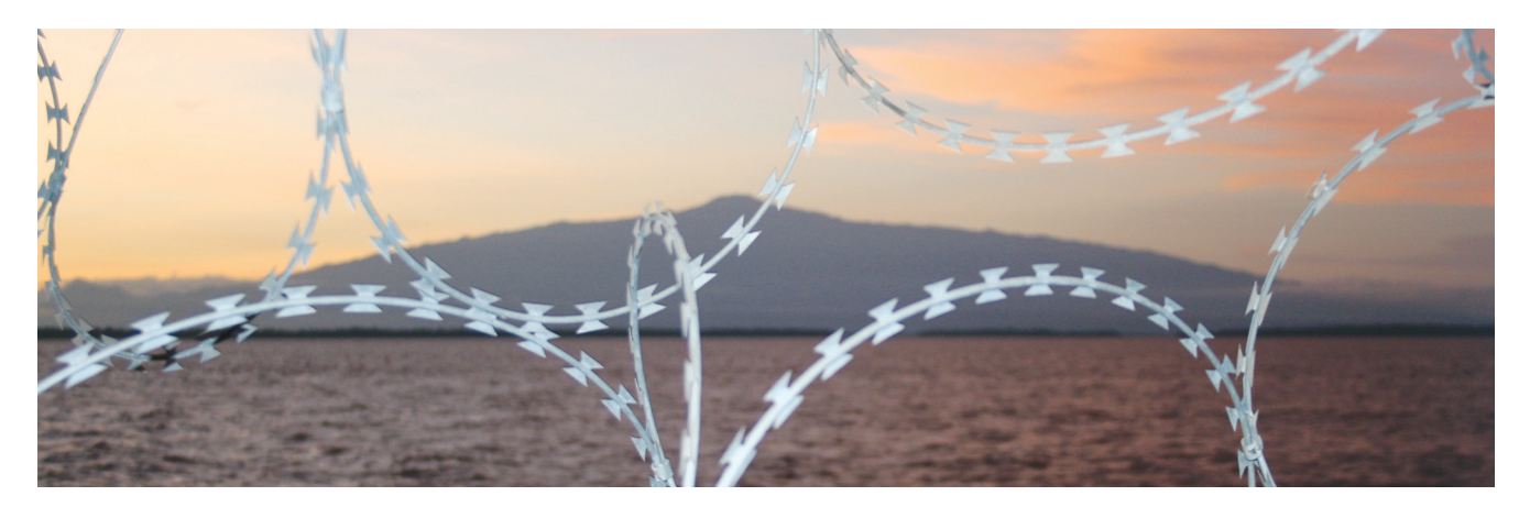
The view from the deck of a ship surrounded by barbed wire against pirate attacks.

Seafarers' Rights International is a unique and independent centre dedicated to advancing seafarers' interests through research, education and training in the law concerning seafarers.