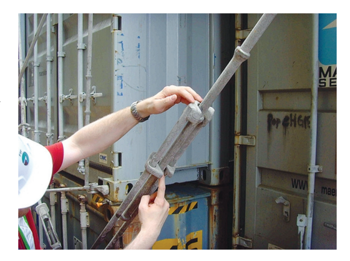
Cargo Handling by Seafarers.

Cargo-handling is dangerous for seafarers because you are not trained for the work. In January 2007, a Filipino seafarer was crushed to death by an eight-ton container on an Antigua and Barbuda-flagged vessel berthed in the port of Rotterdam in the Netherlands. The tragedy happened while crew members were