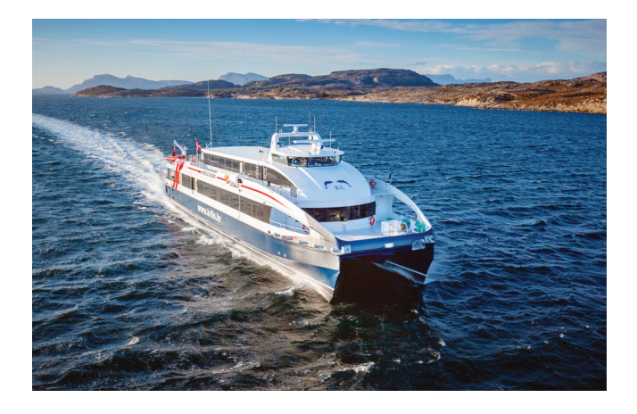
Krilo Carbo catamaran making way.

On its round-the-globe expedition, the TÛRANOR PlanetSolar will pioneer the use of sustainable energy technology on water. It is different from anything that has happened in the field of mobility to date. This solar catamaran uses the very latest cutting-edge technology available on the market. Their intention is to demonstrate that high-performance solar mobility can be realised today by making innovative use of existing materials and