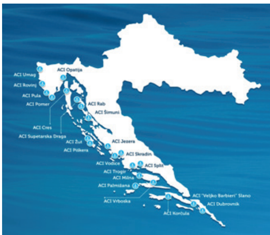
Figure 3. ACI marinas in Croatia, Source: Adriatic Croatia International Club (2019).

In the Adriatic Croatia International Club (ACI), the largest marina system in the Mediterranean and the leading Croatian nautical company, 22 marinas are operating, as shown in Figure 3.