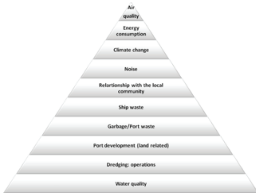
Figure 1. Environmental priorities of European ports, Source: ESPO Environmental Report (2019).

(ESPO) and the ports participating to the EcoPorts network regularly monitor the environmental priorities of European port authorities (Figure 1) to identify the high priority environmental issues and set the framework for guidance and initiatives to be taken by ESPO (Scientific Enterprises Ltd, 2015).